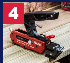
AND YOU'RE DONE